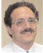
by Mark Gebbia, Illinois Capacitor, Inc.

With the rapidly changing landscape in ICs and other semiconductors, it is easy to think of the supporting cast of electrolytic capacitors as a design constant. While many electrolytics look similar to their counterparts of a few years ago, capacitor technology has continued to evolve. Today's electrolytics are more reliable, offer higher capacitance densities and more mounting options. One of the parameters that has recently come under closer scrutiny by designers is ESR, or equivalent series resistance . Stated in ohms and referenced to specific frequencies, ESR is easier to define than it is to specify.