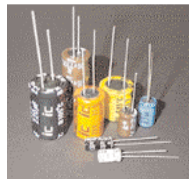
Low ESR aluminum electrolytic capacitors from Illinois Capacitor.

determine the acceptable limits and select capacitors that "match" its requirements. It is important to review the test conditions used by the capacitor manufacturer, as different test conditions can significantly alter operation in the circuit. Also, manufacturers such as Illinois Capacitor ( www.illcap.com ) offer applications engineering support to assist designers in evaluating their needs and to recommend appropriate capacitor types. Some also offer Web-based tools, such as the capability to search their database by operating parameter.